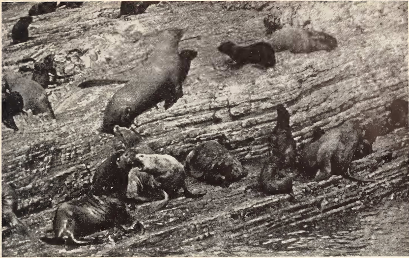
Fig. 4. A group of Steller sea lion cows and pups with one of the former threatening an intruding California sea lion bull (lower left). Año Nuevo Island, California, September 1, 1962

In general, therefore, these two species are separated during most of the breeding season but during the short overlapping periods that adult males of both species are together no marked aggressive behaviour has been noted. In the post-breeding season the female and pup Steller sea lions and the male California sea lions behave essentially as one species. Frequently rafts of 50 to 200 animals in the water are composed of both species.